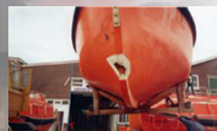
Polyrep, spot repair yachts