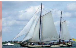
Gouwzee Sailing yachts, maintenance aboard